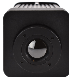
FMX 700 P-Series

Remote fixed mounted thermal management systems are designed to provide detection capabilities of hard-to-reach areas or places where safety is a concern. FMX 700 devices have been utilized to monitor critical equipment, flares, flare pilots, electrical connections, and tank levels in real-time. Perfect for finding and locating critical failures as well as abnormal temperatures in pipelines and storage facilities.