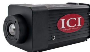
FMX 700 P-Series