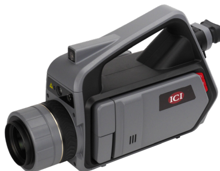
Gas DetectIR VOC Gen 2

Numerous industries engage extensively with methane, organic gases, and chemical compounds. The potential harm to both life and the environment arising from the release of volatile organic compounds and flammable toxic gases has become a matter of global concern. ICI's Gas DetectIR VOC Gen 2 swiftly visualizes and locates gas leaks, making it a critical asset for detecting latent faults and mitigating exposure to potentially hazardous chemicals. Notably, the device holds ATEX certification, ensuring its adherence to explosion-proof standards.